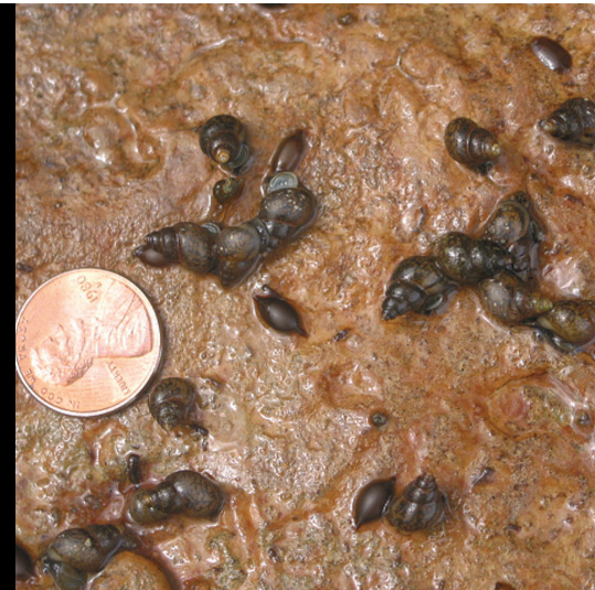
Minnesota Department of Natural Resources, Bugwood.org