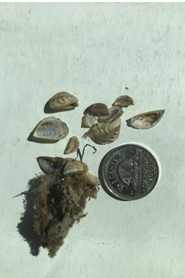
Government of Alberta

Dreissena bugensis (Andrusov, 1897) syn. Dreissena rostriformis bugensis