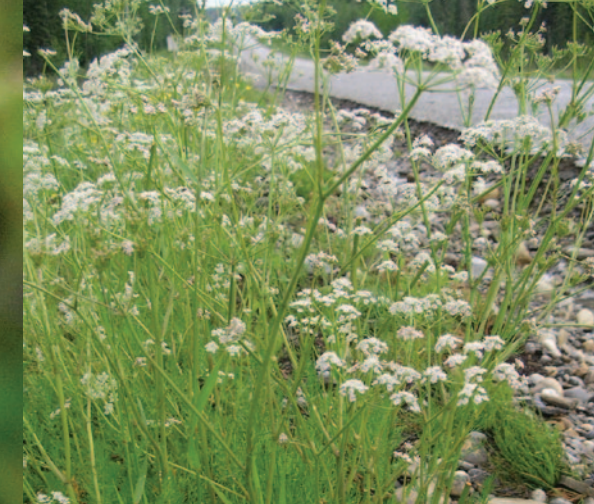
Alberta Sustainable Resource Development