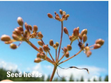
Alberta Sustainable Resource Development