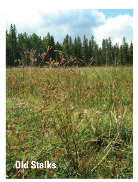
Alberta Sustainable Resource Developmen