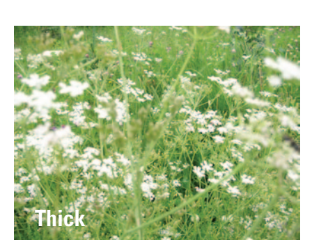
Alberta Sustainable Resource Development