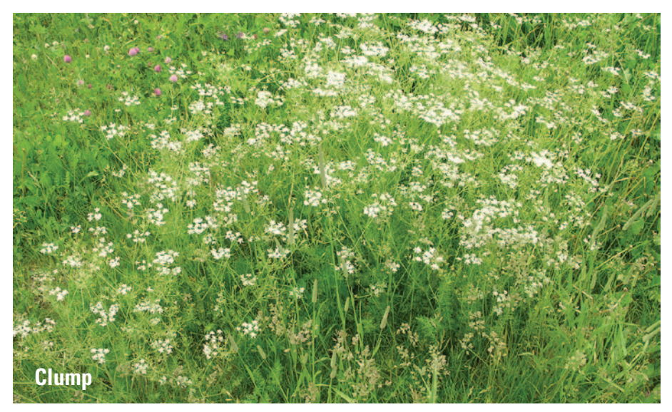
Alberta Sustainable Resource Development