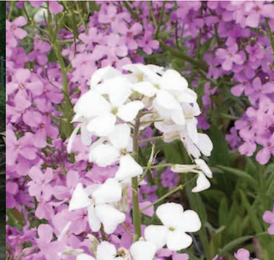
Alberta Sustainable Resource Development