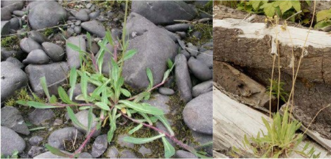
BC Ministry of Forests, Key to Identification of Invasive and Native Hawkweeds in the Pacific Northwest